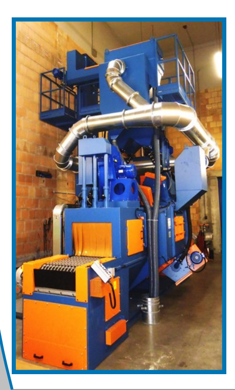
RB-600 AH 4