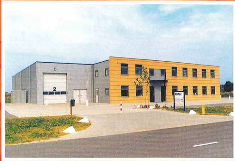
our office and factory