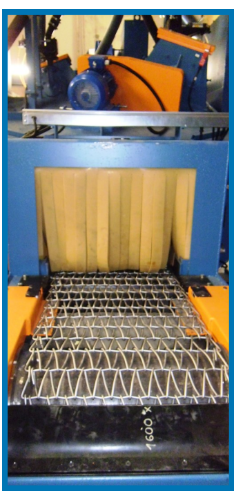
RB-600 AH 4